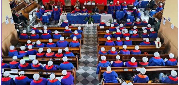
Members of the Mutare District's women's organization celebrate the group's unwavering commitment to education during their district conference at Hilltop United Methodist Church in Mutare, Zimbabwe. Representatives from urban and rural circuits highlighted their accomplishments in establishing scholarship programs and providing educational opportunities to underprivileged children.