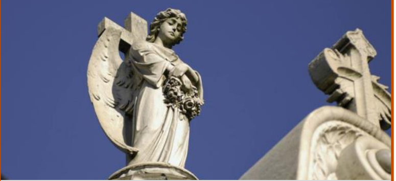
An angel in the Recoleta Cemetery (Spanish, Cementerio de la Recoleta) located in Buenos Aires, Argentina. The cemetery is located at the church of Our Lady of Pilar (Nuestra Señora del Pilar Basilica) which was built in 1732.

This content was produced by Ask The UMC, a ministry of United Methodist Communications.