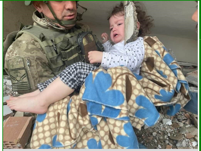
A little girl is rescued in Gaziantep, Turkey after a series of earthquakes hit Turkey and Syria on Monday, Feb. 6, 2023.

The earthquake and aftershocks also impacted northwest Syria, where 4.1 million people depend on humanitarian assistance. Syrian communities, many of them women and children, are simultaneously facing an ongoing cholera outbreak and extreme winter weather, including heavy rain and snow.