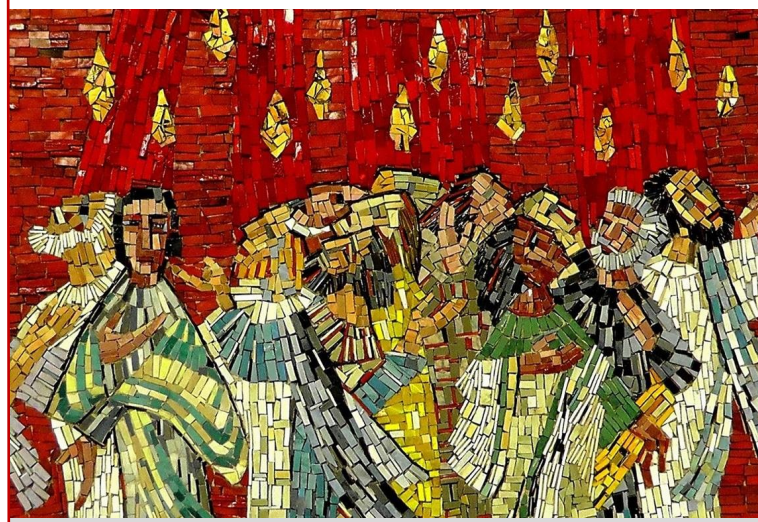
Pentecost mosaic 1500

The word <u>Pentecost</u> comes from a Greek word meaning fiftieth. The Jewish Festival of Pentecost (called Shavuot, meaning "weeks" in Hebrew) falls on the fiftieth day after the original Passover. On that day, God gave the Torah to Moses on Mount Sinai. The Christian festival of Pentecost falls on the 50th day