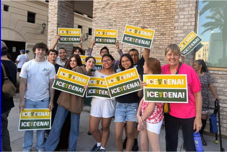
Members of the youth group at First United Methodist Church in Pasadena, Calif., join in a peaceful demonstration after worship June 8. The protests against U.S. Immigration and Customs Enforcement targeting of workers in the city led ICE agents to leave nearby hotels that day.

including Austin, Texas; Chicago; Dallas; Las Vegas; Seattle and Spokane, Washington. The Trump administration is also planning to send ICE tactical teams to Northern Virginia, Chicago, New York, Philadelphia and Seattle .