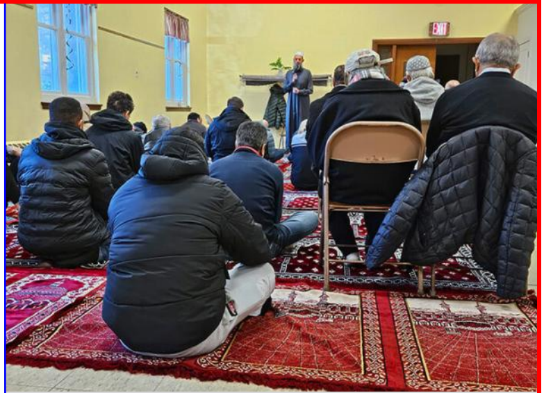
Members and guests of As-Salaam Islamic Society listen to a teaching (khatbah) by a guest lecturer during Friday afternoon prayers (Jum'ah) in St. Luke United Methodist Church's Lurwick Hall.

While Christians remained the world's largest