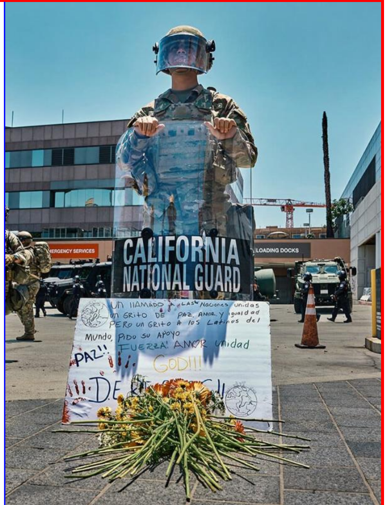
A National Guardsman stands watch at a June 10 prayer vigil organized by the United Methodist-founded Clergy and Laity United for Economic Justice in downtown Los Angeles. The participants placed in front of him a poster in Spanish calling for peace, love, and equality and asking for support. United Methodists across the Los Angeles area are working to stand up for immigrant rights while trying to de-escalate a tense situation as the Trump administration has deployed National Guard troops and Marines to quell protests against U.S. Immigration and Customs Enforcement.

The following protests — which have included peaceful demonstrations as well as violent clashes with police — prompted President Trump to mobilize some 4,000 National Guard troops and 700 U.S.