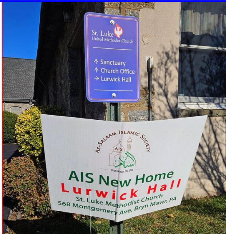
Signage outside of St. Luke United Methodist Church in Bryn Mawr, Pa., shows that the church building is also a meeting place for the As-Salaam Islamic Society (AIS).

St. Luke had hosted a loosely organized Muslim prayer group for several years. But group members also moved around to other locations, including a nearby community center that became unsuitable for their Sunday