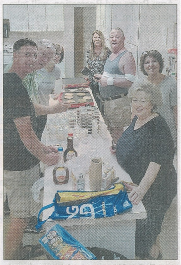
SENIOR LIFE Volunteers serve all who show up on Saturday mornings.

or send breakfast-designated financial donations to the church at 206 S. Hopkins Ave. in Titusville.