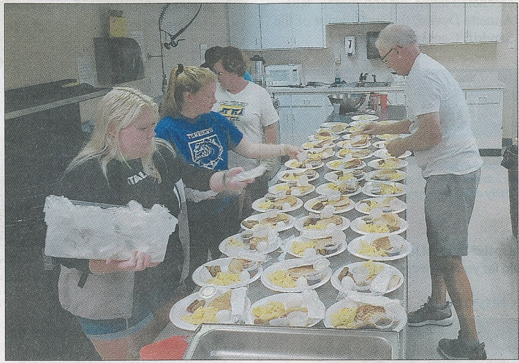
SENIOR LIFE

Each Saturday, volunteers at First United Methodist Church in Titusville prepare a community breakfast (before the COVID pandemic) served in the church parking lot.