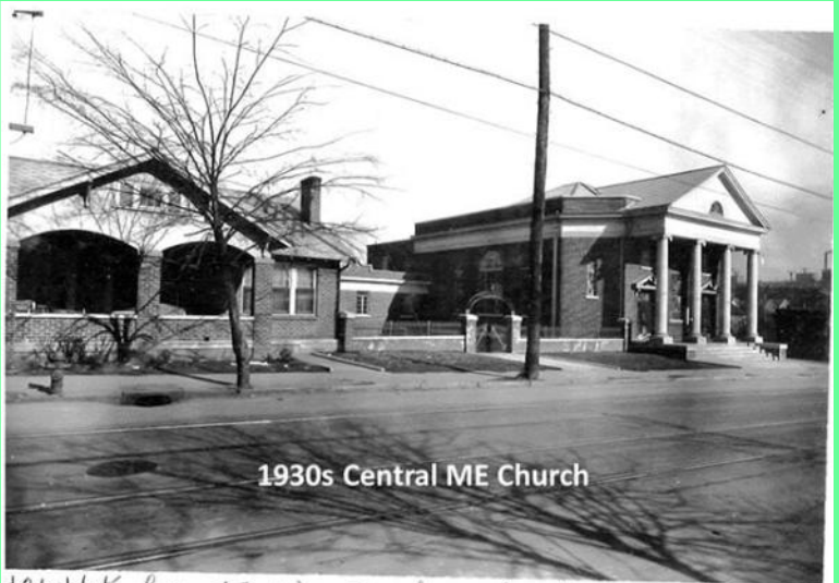
1930s Central ME Church

In January, guided by research and planning, Central began offering traditional worship at 8 a.m., still “rooted in the Black experience,” and saw an increase in attendance. In April, it plans to launch “a new, nontraditional, more upbeat, inclusive and multifaceted experience” that should draw more young and diverse