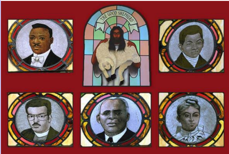
Windows from the original Mother African Zoar United Methodist Church building in Philadelphia depict Jesus Christ, the Good Shepherd and early clergy and lay leaders. The windows are currently in protective storage.

but we're mostly thankful that we're able to serve our people just like Jesus would do."